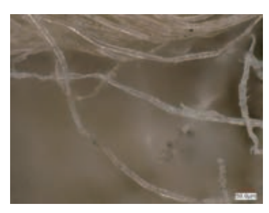
Fig. 2 Microscopic photograph of Otani 6117, written in an archaic type of the Sogdian script and in an early phase of the Sogdian language, with blurred Chinese text on the other side. Probably written in the late 4<sup>th</sup> century CE near Loulan. Larger image in [3]